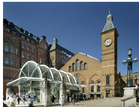
Liverpool Street Station